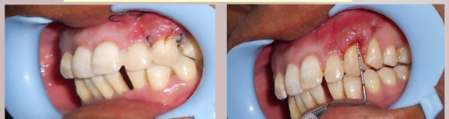
CTG PLACED BY MICROSURGERY BETTER HEALING IN MICROSURGICAL SITE