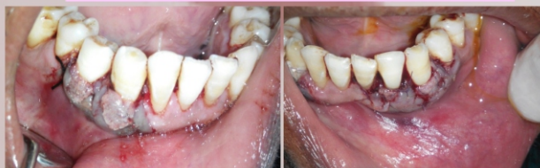
ALLODERM PLACED COMPARING MACRO & MICRO SURGICAL TECHNIQUES