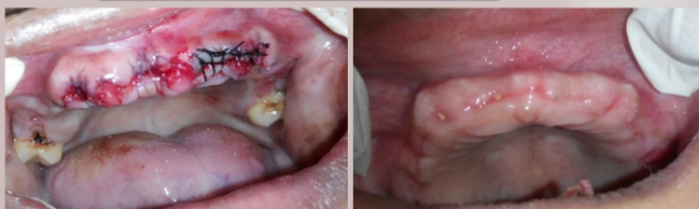
MACRO & MICRO SURGICAL SITES BETTER HEALING IN MICROSURGICAL SITE