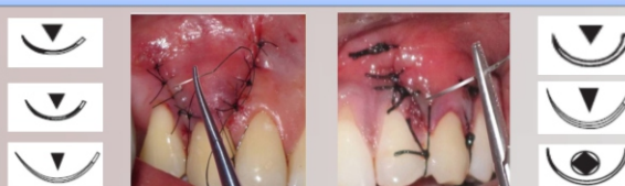
MICROSURGICAL SUTURING MACROSURGICAL SUTURING

CONCLUSION : Periodontal Microsurgery plays a imp role in enhancing periodontal plastic/esthetic surgery. It is the refinement of basic surgical techniques made possible by the improvement in visual acuity gained with the use of the surgical microscope. It allows the surgeon to practice enhanced, precise, delicate surgical procedures that have important healing processes and outcomes for patients.